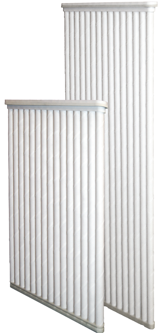
HELIX TUBE RACK