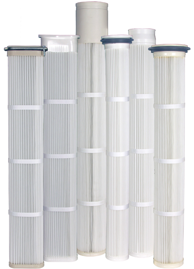
Ultra-Web SB Pleated Bag Filters

Available for all popular brands of baghouse collectors